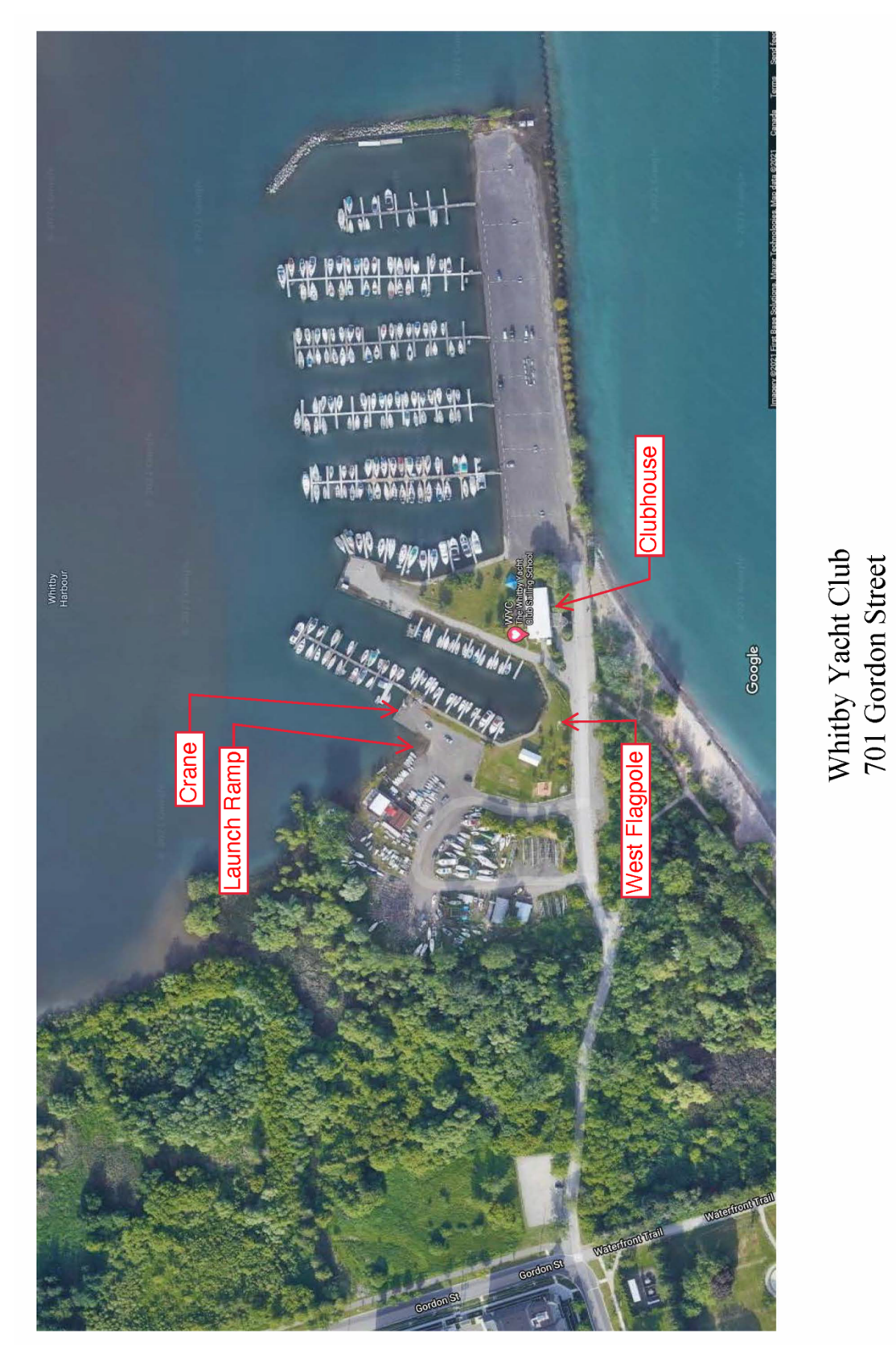
Addendum B Event Venue