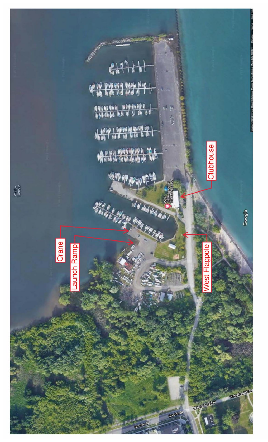
Addendum B Event Venue

Whitby Yacht Club 701 Gordon Street Whitby, ON