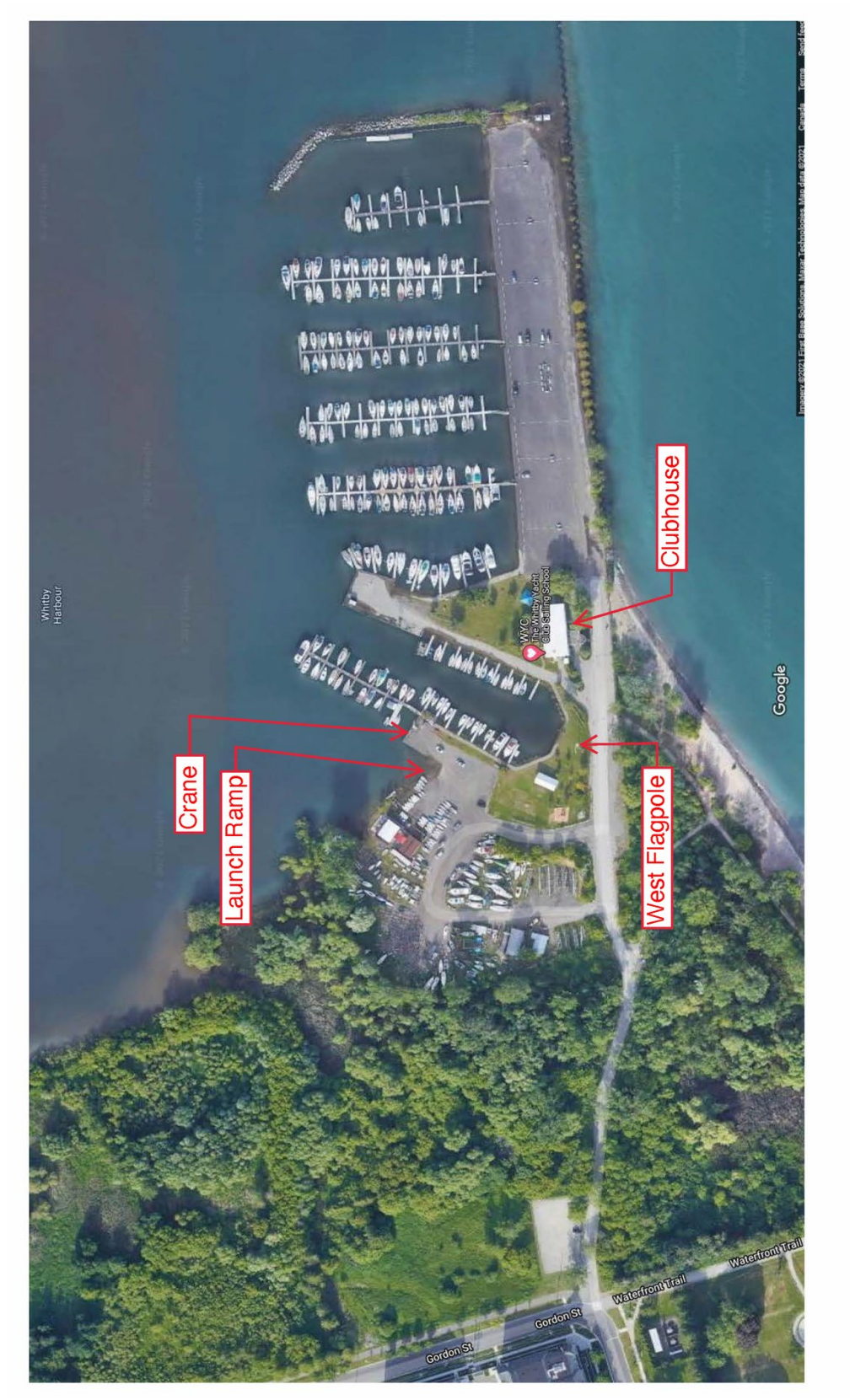
Addendum A Event Venue

Whitby Yacht Club 701 Gordon Street Whitby, ON