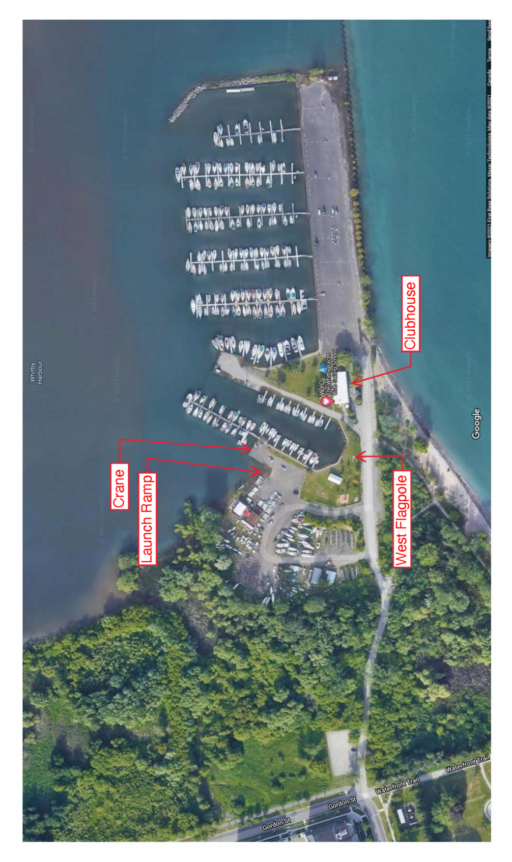
Whitby Yacht Club 701 Gordon Street Whitby, ON